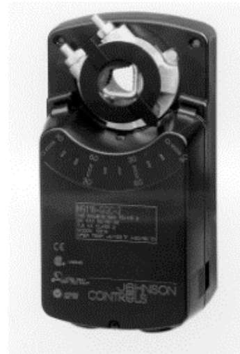
Figure 1: M9108-AGx-2 Series

A single M9108-AGx-2 model delivers up to 70 lb·in (8 N·m) of torque. The angle of rotation is mechanically adjustable from 0 to 90° in 5-degree increments. Integral auxiliary switches are available to indicate end-stop position or to perform switching functions at any angle within the selected rotation range. Position feedback is available through either a 135 or 1,000 ohm potentiometer.