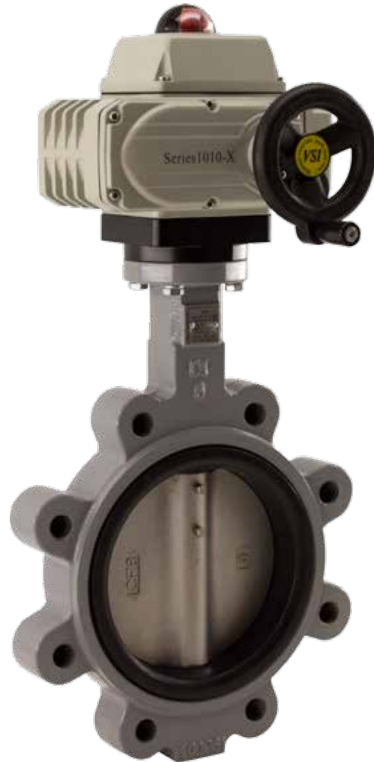
Shown with optional handwheel