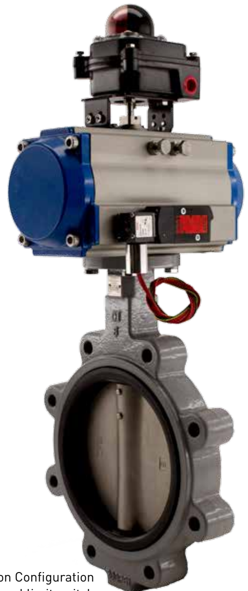
2 Position Configuration Shown with optional limit switch

Air is supplied to Port B forcing the pistons toward each other (towards center), rotating the drive pinion clockwise and exhausting air out of Port A